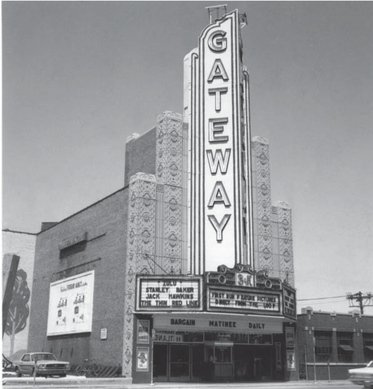
This photo of the Gateway Theater was taken in July of 1964. Parked in the parking lot, Ford's newest car, a 1964-1/2 Mustang.