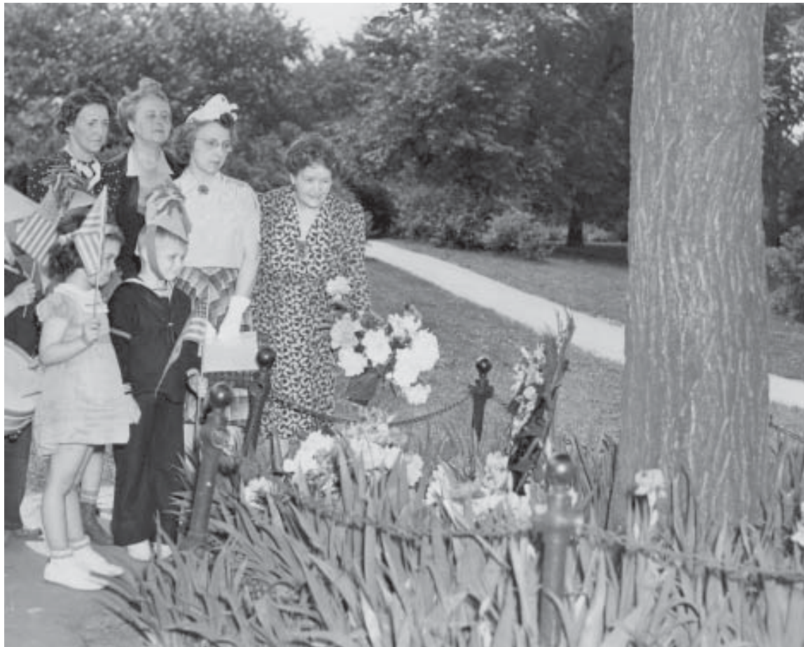
The Memorial Tree in Portage Park. CA 1950