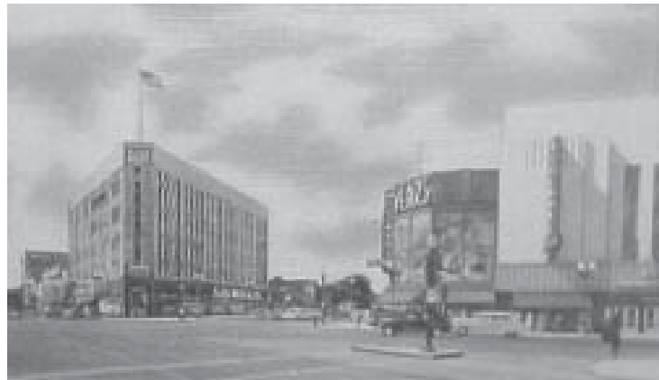
Postcard view of 6 corners. Sears' display window can be seen in the center of the photo. Photo taken in late 40's or early 50's.

I remember going to Bargain Mart with Mom. A small little store that was more like what we see today as TJMAX where they buy up lots of stuff. At Bargain Mart, it was laid out in a few long aisles, not much higher than a counter and we would get good deals. Next door to this was the record store (to the south) where we would go in and could listen to records before buying them, And of course, that included the latest in 45rpm records and we would also get our SILVER DOLLAR SURVEY of the Top FORTY from WLS. The Survey showed all the top songs of the week.