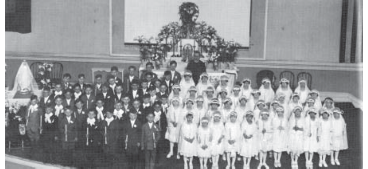
Sacraments of Holy Eucharist – The very first class of First Communicant: May 2, 1926 in Beaubien School Auditorium