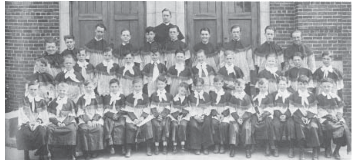
1928 Alter Boys