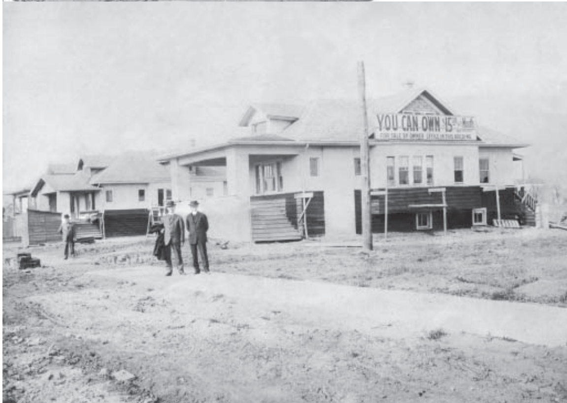
Photo of the construction of the bungalows on the 4600 block of Leclaire Avenue. The sign on the house reads "YOU CAN OWN $15.00 per Month and interest – For Sale By Owner Office in the Building".