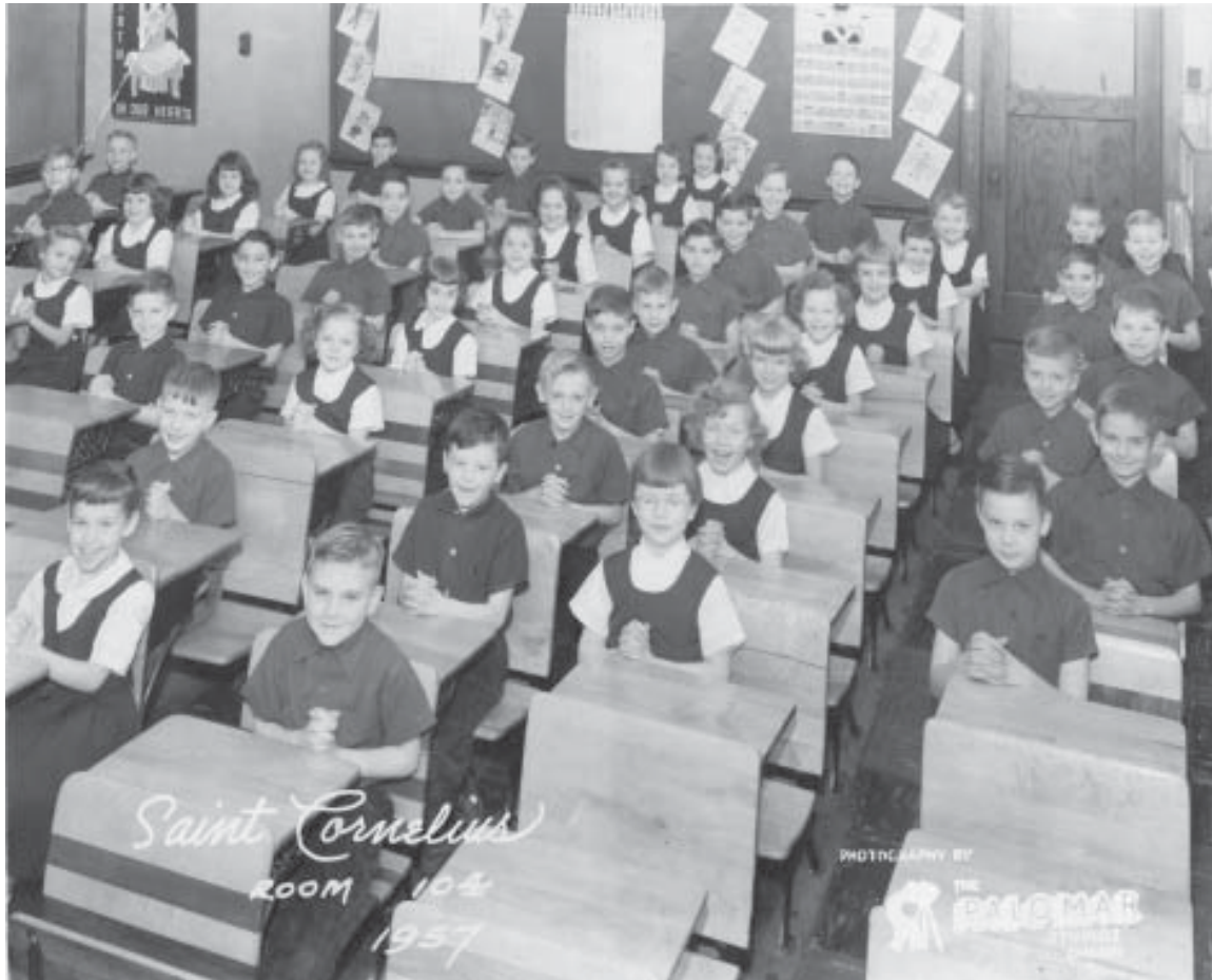
Class Photo from 1957

During the next decade the growth was phenomenal and much more classroom space was desperately needed. So it was decided that a new church be built and the old church be converted into classrooms. The old church became 6 new classrooms, when the new church was erected on Foster Avenue in 1965. At the time of completion of the new church, the parish had grown to 2500 families and the school enrollment had reached the 850 mark.